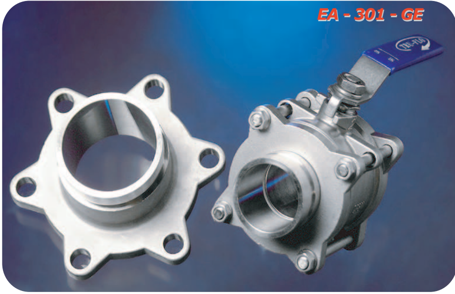
EA - 301 - GE